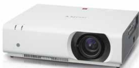
VPL-CH355, VPL-CH375 and VPL-CH350

When it comes to equipping medium to large-sized classrooms or meeting rooms, cost is critical. The VPL-CH355, VPL-CH375 and VPL-CH350 are a cost-effective choice with no compromise on picture quality.