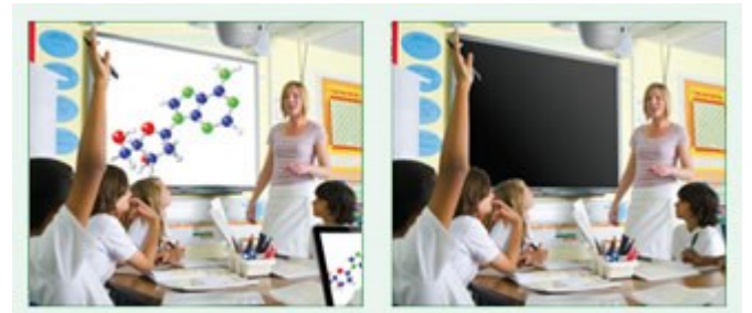
Eco AV mute off 100% power consumption

Stay in control of your presentation with Eco AV mute. Direct your audience's attention away from the screen by blanking the image when no longer needed. This also reduces the power consumption by up to 70%, further prolonging the life of your lamp.