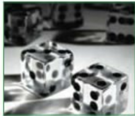
20,000:1 Contrast Ratio