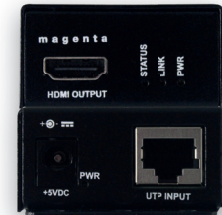
HD-ONE DX500 TRANSMITTER (L) AND RECEIVER (R) FRONT/BACK VIEW