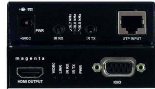
HD-ONE LX500 TRANSMITTER (L) AND RECEIVER (R) FRONT/BACK VIEW