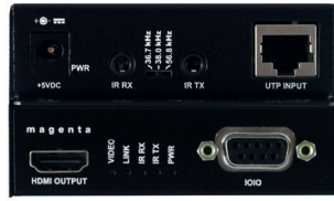
HD-ONE LX TRANSMITTER (L) AND RECEIVER (R) FRONT/BACK VIEW