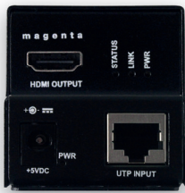
HD-ONE DX TRANSMITTER (L) AND RECEIVER (R) FRONT/BACK VIEW