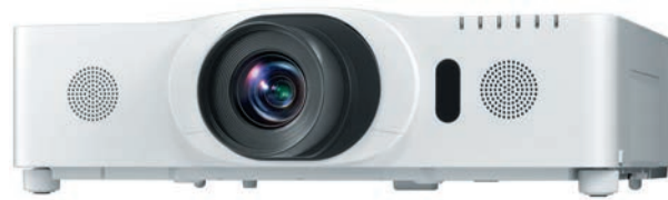
Front 3/4 View

wireless presentation compatible. Plus, embedded networking gives you the ability to manage and control multiple projectors over your LAN (scheduling of events, centralized reporting, image transfer, and e-mail alerts). Even with the array of advanced features, Hitachi's CP-WX8265 is designed for user-friendly operation and installation convenience.