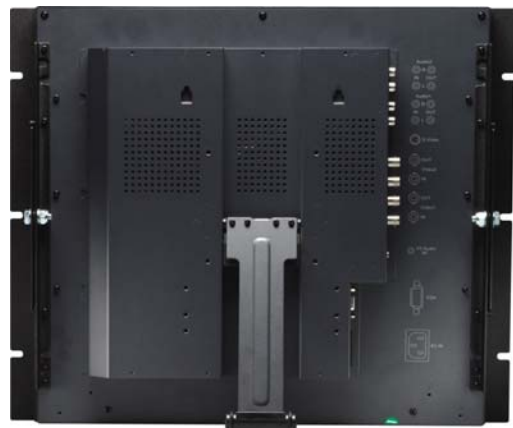
Monitor Rear View