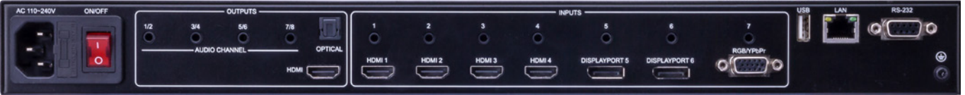
Its deceptively simple appearance disguises its extremely powerful abilities as a 4K Multiviewer / Presentation Switcher.