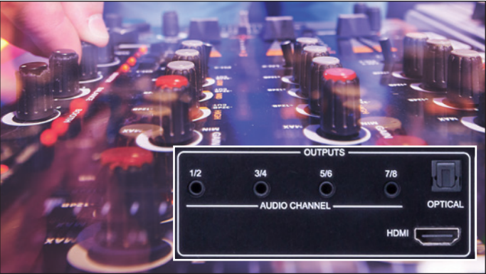
Embed / de-embed any of the 7 audio inputs