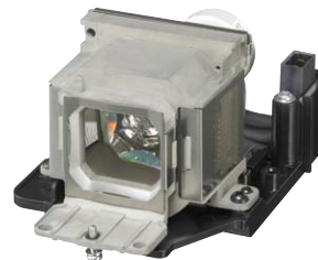
LMP-E212 Projector Lamp (for replacement)