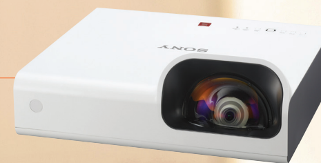
VPL-SW225 / VPL-SX225 WXGA and XGA with 2600~2700 lumens brightness

The projector includes a 16W monaural speaker.