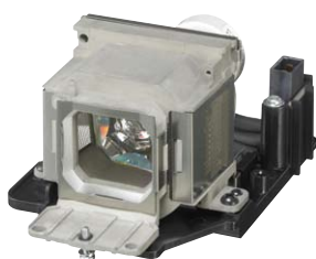
LMP-E212 Projector Lamp (for replacement)