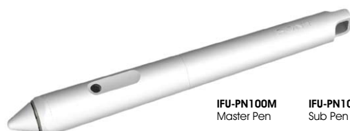
IFU-PN100M Master Pen