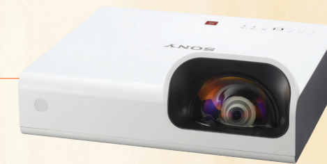
VPL-SW235 / VPL-SX235 WXGA and XGA with 3000~3200 lumens brightness

The S-Series short throw projectors integrate seamlessly with school or office networks