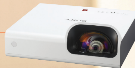
VPL-SW225 / VPL-SX225 WXGA and XGA with 2600~2700 lumens brightness

The projector includes a 16W monaural speaker.