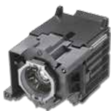
LMP-F370 Projector Lamp