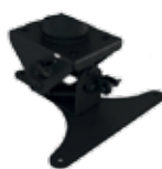
PAM-310 Ceiling mount