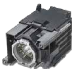
LMP-F280 Projector Lamp