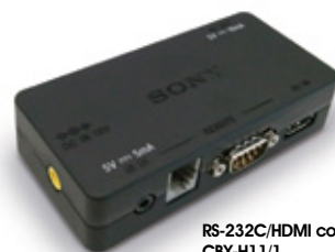
RS-232C/HDMI converter CBX-H11/1

For full features visit www.pro.sony.eu/bravia-display