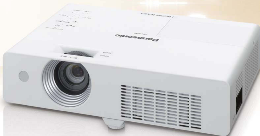
* Featured Image: PT-LW25H