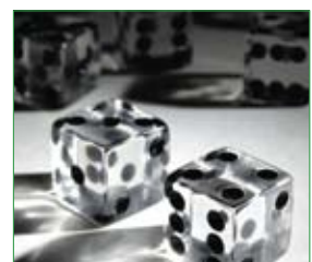
8000:1 Contrast Ratio