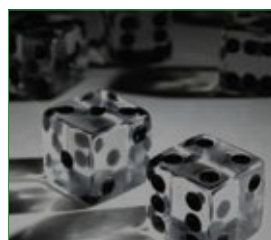
2000:1 Contrast Ratio

DarkChip3™ technology from Texas Instruments combined with Eco+ produces a stunning 8000:1 contrast ratio for pin sharp graphics and crystal clear text. Crisper whites, ultra-rich blacks makes images come alive and text easier to read - ideal for business and education presentations.