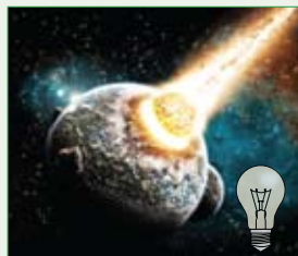
Dark scene ~ 30% Power consumption