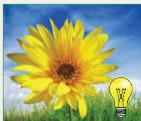
Bright scene ~100% Power consumption