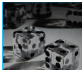
2000:1 Contrast Ratio

DarkChip3™ technology from Texas Instruments combined with Eco+ produces a stunning 10,000:1 contrast ratio for pin sharp graphics and crystal clear text. Crisper whites, ultra-rich blacks makes images come alive and text easier to read - ideal for business and education presentations.