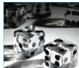
10,000:1 Contrast Ratio