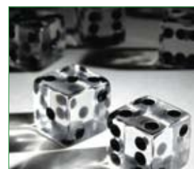
10,000:1 Contrast Ratio