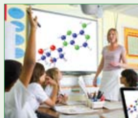
Eco AV mute off

Stay in control of your presentation with the ECO AV mute feature. Direct your audience's attention away from the screen by blanking the image when no longer needed. This also instantly reduces the power consumption to 30%, further prolonging the life of your lamp.