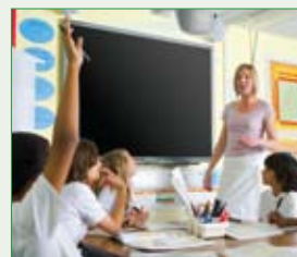
Eco AV mute on