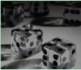
2000:1 Contrast Ratio

Bright 3200 ANSI Lumens, Perfect for projecting in lights on environments. And with DarkChip3™ technology from Texas Instruments combined with Eco+ technology produces a stunning 13,000:1 contrast ratio for pin sharp graphics and crystal clear text. Crisper whites, ultra-rich blacks make images come alive and text easier to read - ideal for business and education presentations.