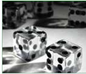
13,000:1 Contrast Ratio