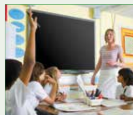
Eco AV mute on 30% Power consumption