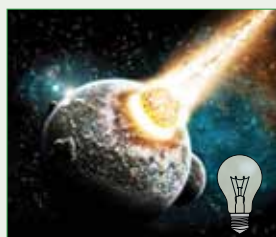
Dark scene ~ 30% Power consumption