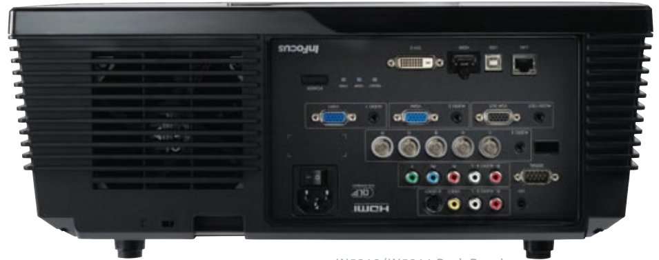
IN5312/IN5314 Back Panel

The 4000 lumens of the IN5314, IN5316HD and IN5318 display crisp, detailed images even in bright rooms. But if even more brightness is needed, you can bump it up to 4500 lumens with the IN5312. Plus, their single-lamp design makes it economical and easy to maintain.