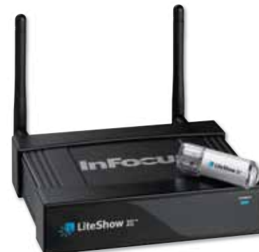
LiteShow III with USB drive

LiteShow III has on-board video decoding, which means it does the heavy lifting instead of the computer. This produces fast and clean reproductions of video and audio even at high resolutions and from older computers with less processing power.