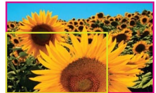
WXGA 1,280 x 800 PIXELS

With WXGA (1280 x 800) and WUXGA (1920 x 1200) native resolutions, the IN5500 series offers substantially wider space to display high resolution images for the next generation of operating systems and full high definition 1080p video.