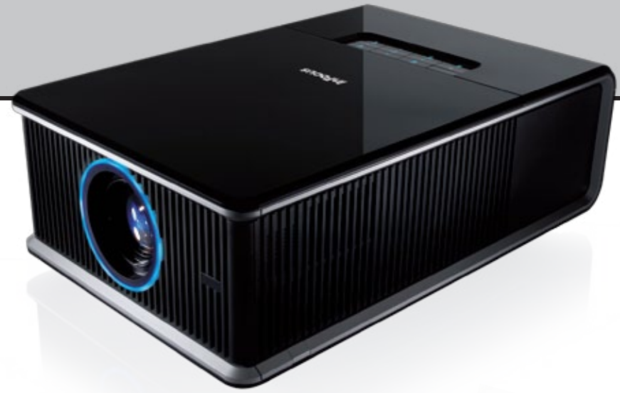
Optional Skin: Gloss Black