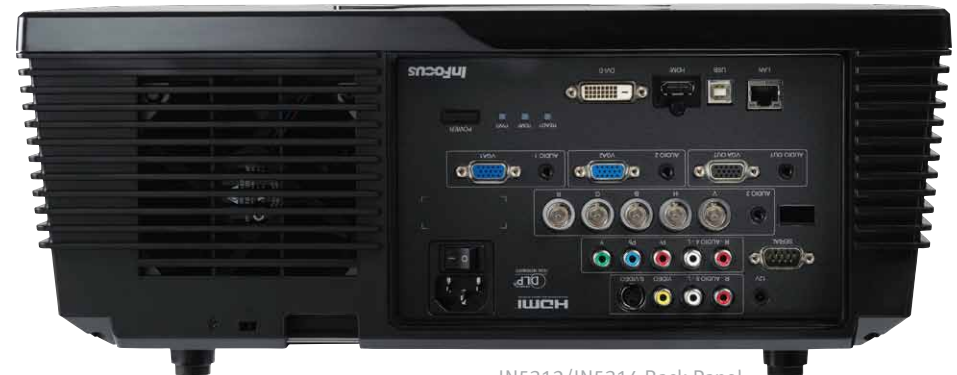
IN5312/IN5314 Back Panel

The 4000 lumens of the IN5314, IN5316HD and IN5318 display crisp, detailed images even in bright rooms. But if even more brightness is needed, you can bump it up to 4500 lumens with the IN5312. Plus, their single-lamp design makes it economical and easy to maintain.