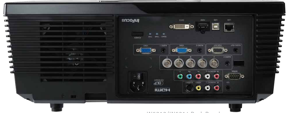
IN5312/IN5314 Back Panel

The 4000 lumens of the IN5314, IN5316HD and IN5318 display crisp, detailed images even in bright rooms. But if even more brightness is needed, you can bump it up to 4500 lumens with the IN5312. Plus, their single-lamp design makes it economical and easy to maintain.