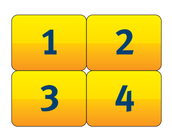
Project up to 4 computer screens at the same time

The optional InFocus LiteShow wireless adapter connects personal computers to InFocus projectors wirelessly. The latest 802.11n connection supports simultaneous transmission of audio, video, and data content and is compatible with PC, Mac, iPhone/iPad, and Windows Mobile operating systems.