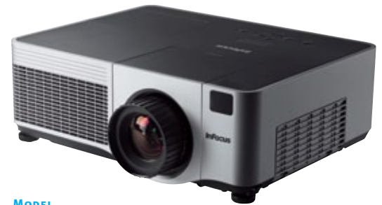
MODEL IN5110 WUXGA (1920 x 1200) 4200 lumens