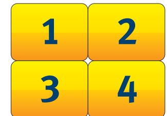
Project up to 4 computer screens at the same time