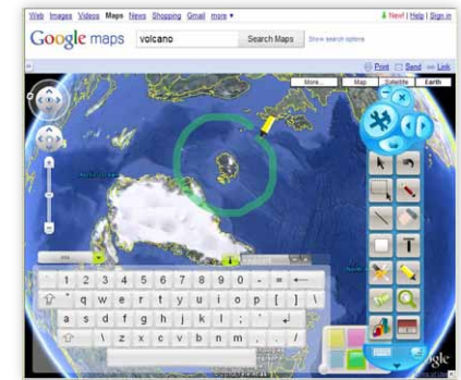
WizTech InFocus Edition software