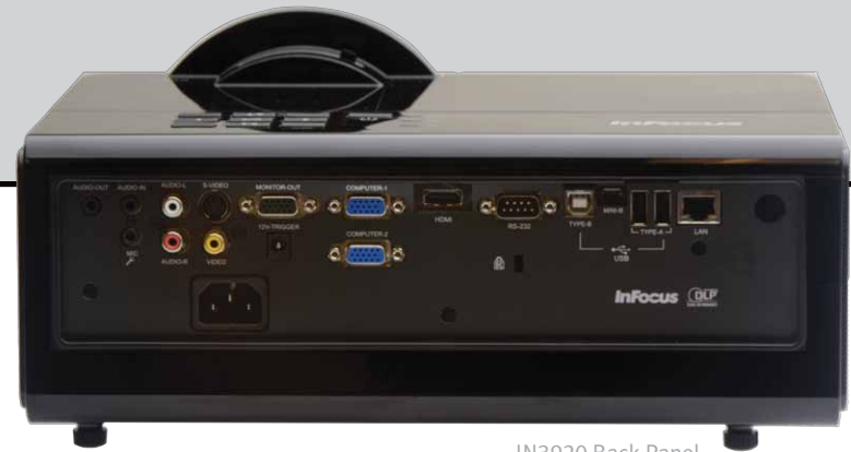
IN3920 Back Panel