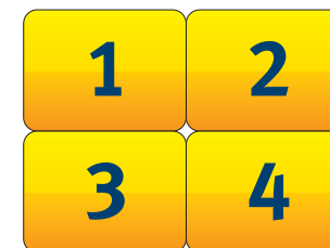
Project up to 4 computer screens at the same time

“... As transformative for education as early interactive boards were – maybe more.”