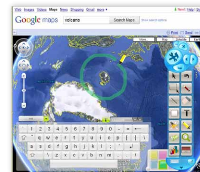
WizTeach InFocus Edition software