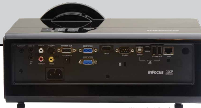
IN3920 Back Panel