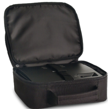
Padded, rugged carrying case is included

The IN1100 Series' durability is backed by our exclusive 5-year limited warranty, so you know it's tough and ready to perform on the road.