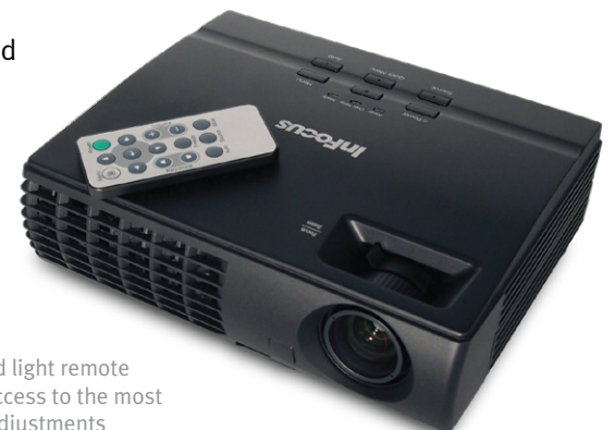
Ultra-thin and light remote provides quick access to the most common adjustments

Plus, you can quickly adjust the keystone to get a square-cornered and true image via the keystone buttons on the remote or the Quick Menu button on top of the projector.