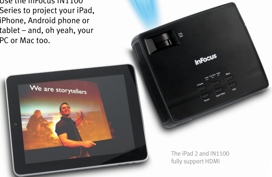
The iPad 2 and IN1100 fully support HDMI

Use the InFocus IN1100 Series to project your iPad, iPhone, Android phone or tablet – and, oh yeah, your PC or Mac too.