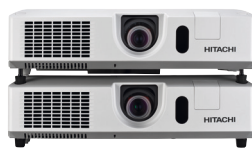
Stackable (projectors sold separately)