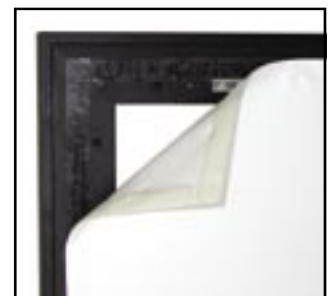
Perfectly flat 'Velcro' fastened surface.

SMART-VIEW SCREEN SYSTEM - simplicity and style from Harkness Screens