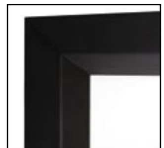
Factory mitred corners for a perfect join.