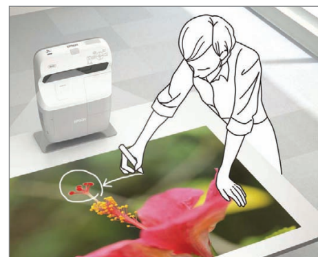
Project onto any horizontal surface such as a tabletop