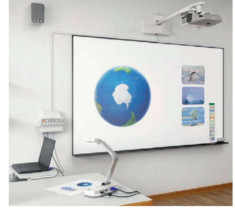
The Epson teaching solution: connect the projector to the ELPCB01 Control and Connection Box for easy access to switches. The tailor-made ELPMB27 Wall Mount reduces installation time