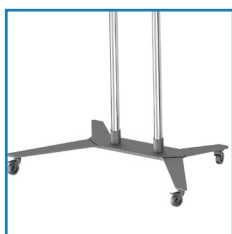
Multifunctional base that can be used as a stand or a trolley (wheels included)