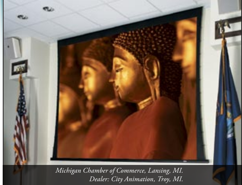
Michigan Chamber of Commerce, Lansing, MI. Dealer: City Animation, Troy, MI.