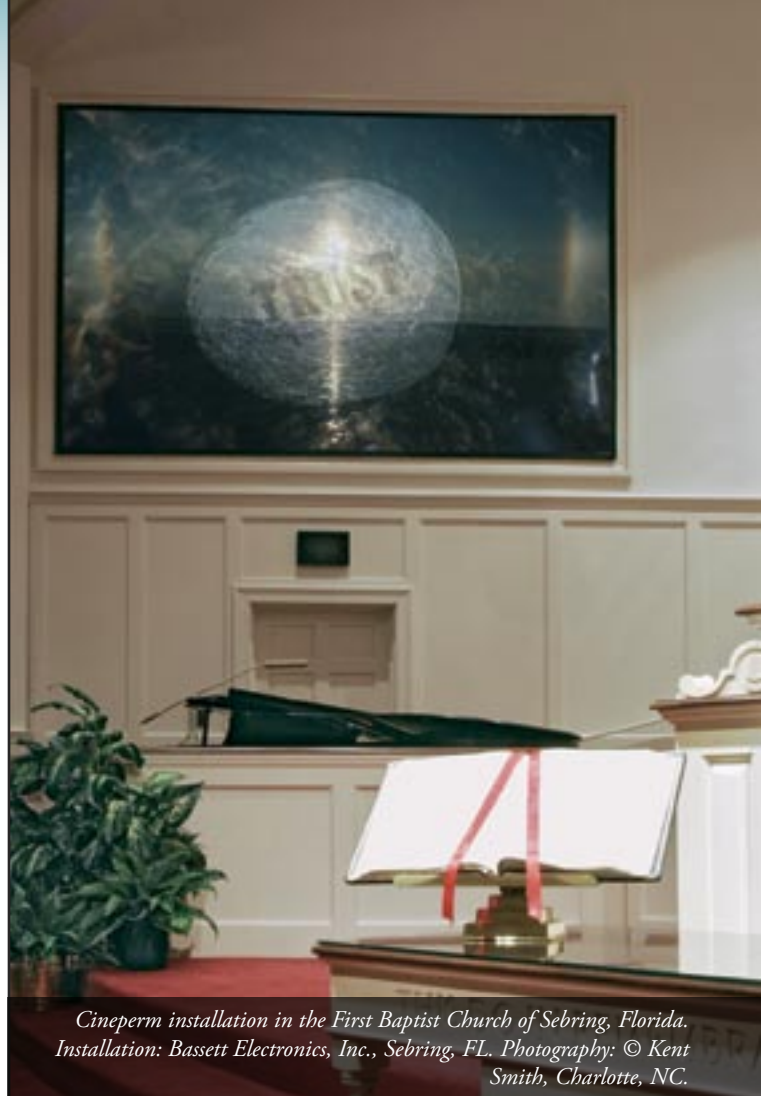
Cineperm installation in the First Baptist Church of Sebring, Florida. Installation: Bassett Electronics, Inc., Sebring, FL.