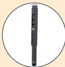
CMS Extension Column With revolutionary notched design for easy adjustment