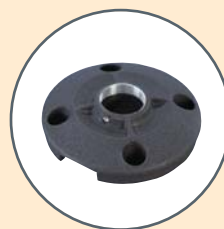
CMS115 Ceiling Plate With cable management