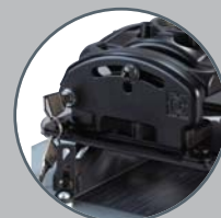
Q-Lock™ Integrated Security