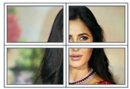
Correct Bezel Compensation