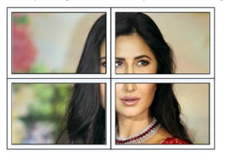
No Bezel Compensation

correctly configured bezel compensation settings should produce: